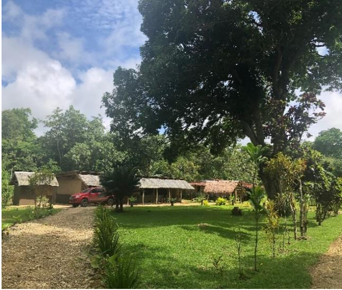
Pacific Link Limited Premises

boosting investment revenue in the ICT and also improving mobile network coverage throughout Vanuatu.