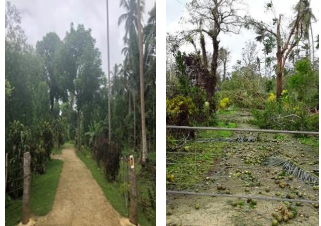
TC Harold causes minor destruction

TC Harold have caused destruction to many business companies especially in Santo, Luganville. Pacific Link Limited is among the business companies located in Santo. The causes of TC Harold causes minor destruction to the company.