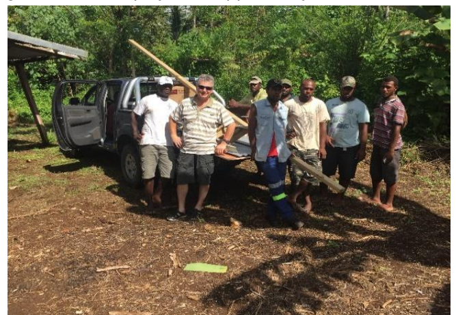
Pacific Limited Team