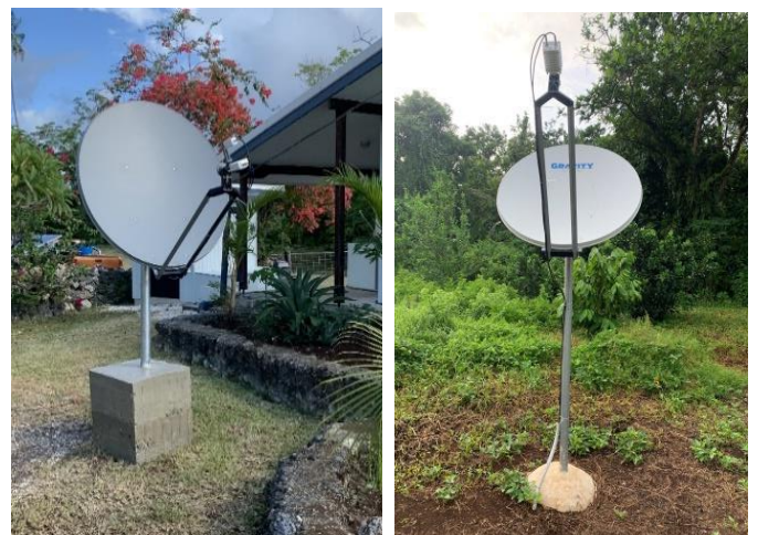
Newly install satellite dish after TC Harold